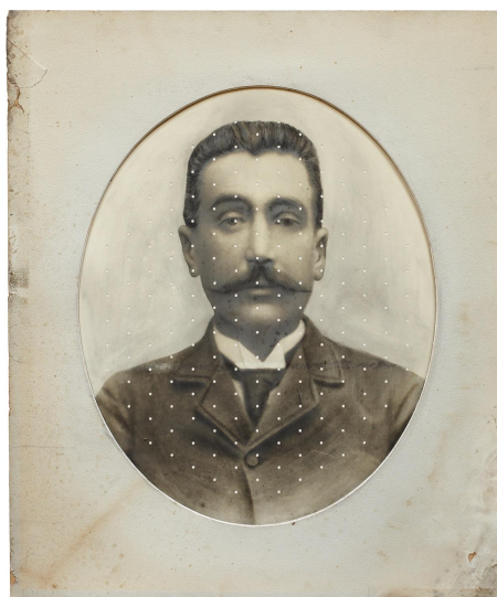
Left: Kensuke Koike, 'Conscience', 2022, Switched vintage photo, Work-in-progress Right: Kensuke Koike, 'Conscience', 2022, Switched vintage photo, 64 × 54 cm (left) and 4.8 × 4 cm (right) unframed

"Before I used archival images, I was shooting photographs on my own and altering them. But because I had the negatives and originals, I could make mistakes in the cutting and altering of them – I could just print another copy of an image and start all over again. I began to use archival images because I wanted to try something more challenging and to delve deeper into the meaning of an image. More risk means that I have to think twice before cutting the originals, and that is important," explains Kensuke Koike.